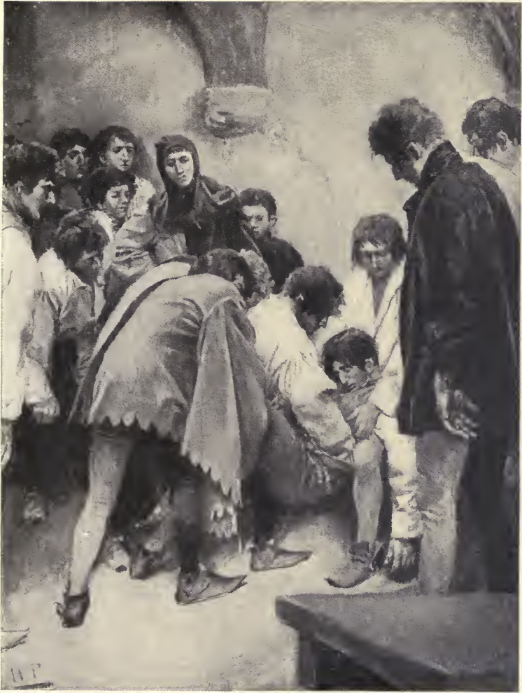
"They bore him away to a bench at the far end of the room"